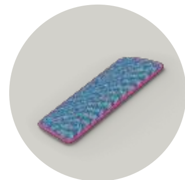
Cleaning mop QSSPRAYMOP

This product protects and maintains your oiled wood floor, preventing it from drying out and looking dull. It's the perfect solution to restore your floor to its original beauty. Apply with a damp cloth every 4 cleaning sessions.