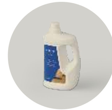
Oil care QSWOILCARE1000

The cleaning kit consists of a mop holder with a refillable water tank and handy lever to easily moisten and mop your floor. Also included: a washable microfiber mop and 1 L of Quick-Step Cleaning product. Now you can clean your floor swiftly and sustainably!