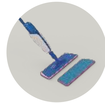
Cleaning kit QSSPRAYKIT

This cleaning product was specifically developed for Quick-Step floors. It cleans the surface thoroughly and safeguards its original appearance, maximising that 'new floor' experience.