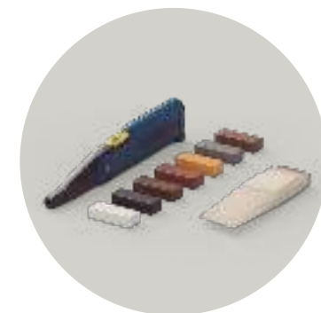
Repair kit QSREPAIR

A sturdy microfiber mop, machine washable up to 60 °C. This mop is compatible with the Quick-Step Cleaning kit.