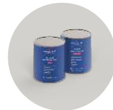
Maintenance oil 1 L QSWMAINTOILN / QSWMAINTOILW

Easily repair light damage and match the original colour of your floor with this kit. For detailed step-by-step instructions, visit quickstep.com .