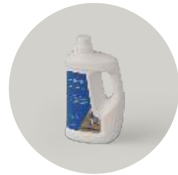
Cleaning product 1 L or 2.5 L QSCLEANING1000 QSCLEANING2500

This cleaning product was specifically developed for Quick-Step floors. It cleans the surface thoroughly and safeguards its original appearance, maximising that 'new floor' experience.